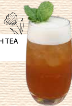
EARL GREY PEACH TEA ice 28.0 K