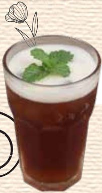
PADI HOUSE TEA hot / ice 15.0 K