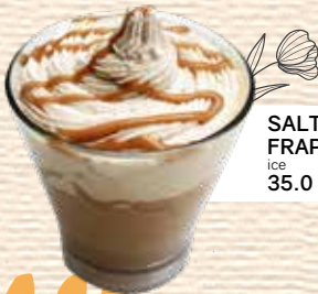
SALTED CARAMEL FRAPPE ice 35.0 K