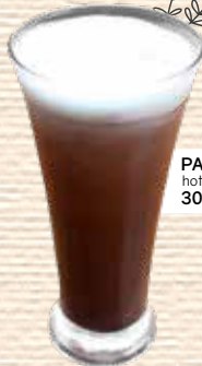
PADI CHOCOLATE hot / ice 30.0 K