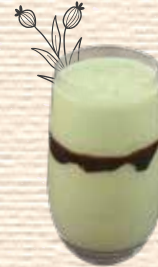
AVOCADO JUICE 30.0 K