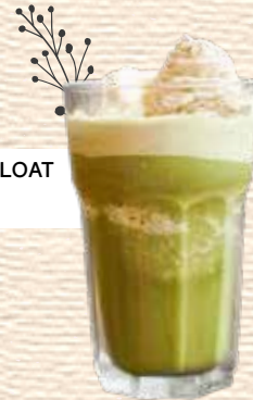
GREEN MATCHA FLOAT ice 35.0 K