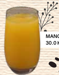
MANGO JUICE 30.0 K