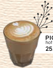
PICCOLO hot 25.0 K