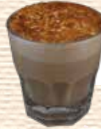
MACADAMIA BRULEE hot 35.0 K