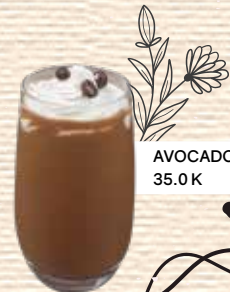
AVOCADO COFFEE 35.0 K