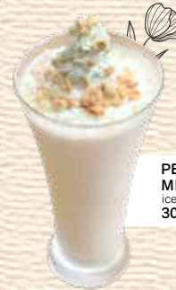
PEANUT BUTTER MILKSHAKE ice 30.0 K