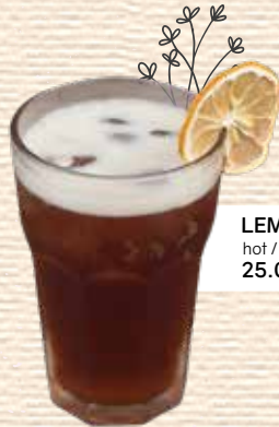
LEMON TEA hot / ice 25.0 K