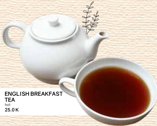
ENGLISH BREAKFAST TEA hot 25.0 K