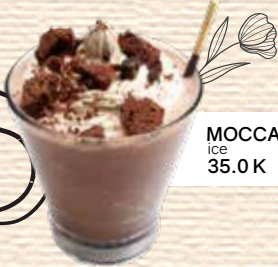
MOCCA CHIP FRAPPE ice 35.0 K