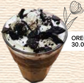
OREO FRAPPE 30.0 K