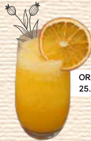
ORANGE JUICE 25.0 K