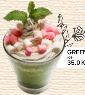
GREEN TEA MINT ice 35.0 K