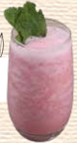
STRAWBERRY SMOOTHIES ice 30.0 K