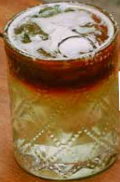
SHAKEN ESPRESSO LYCHEE Ice 35.0 K