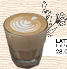
LATTE hot / ice 28.0 K