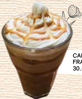
CARAMEL MACHIATO FRAPPE 30.0 K