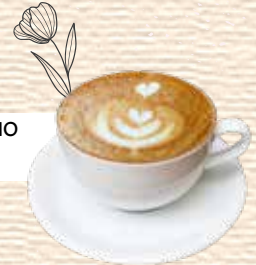
CAPPUCCINO ice / hot 28.0 K