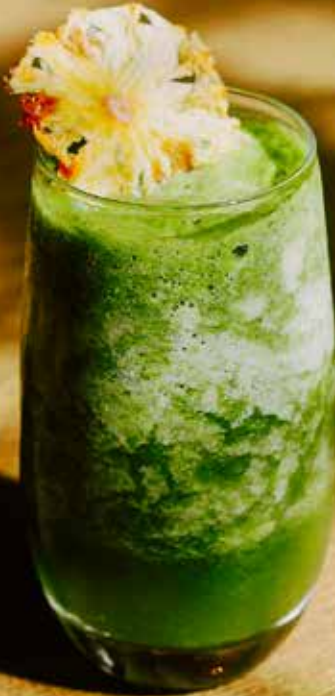
GREEN HEALTHY JUICE ice 25.0 K