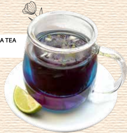
AURORA TEA hot 35.0 K