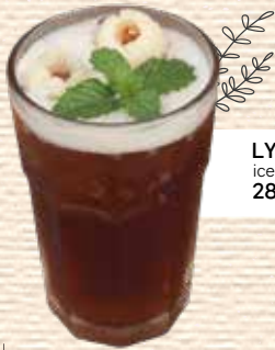
LYCHEE TEA ice 28.0 K