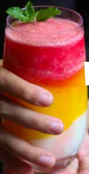
RAINBOW JUICE ICE 28.0 K