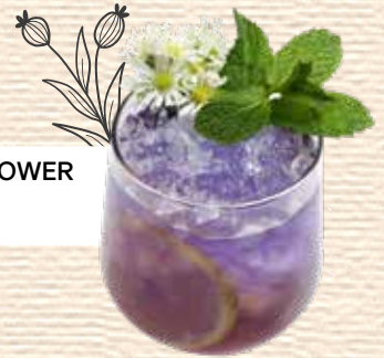
AURORA ELDER FLOWER ice 30.0 K