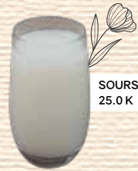
SOURSOP JUICE 25.0 K