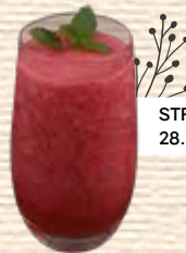
STRAWBERRY JUICE 28.0 K