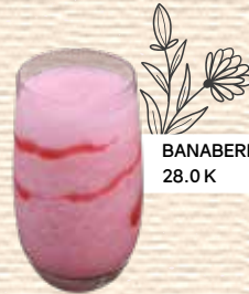
BANABERRY JUICE 28.0 K