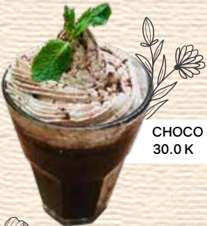
CHOCO MINT FRAPPE 30.0 K