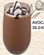
AVOCADO CHOCOLATE 35.0 K