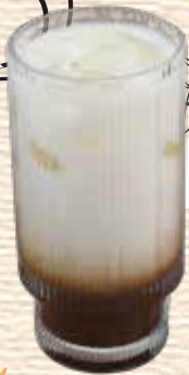
ES KOPI SUSU ice 20.0 K