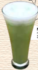
MATCHA LATTE hot / ice 30.0 K