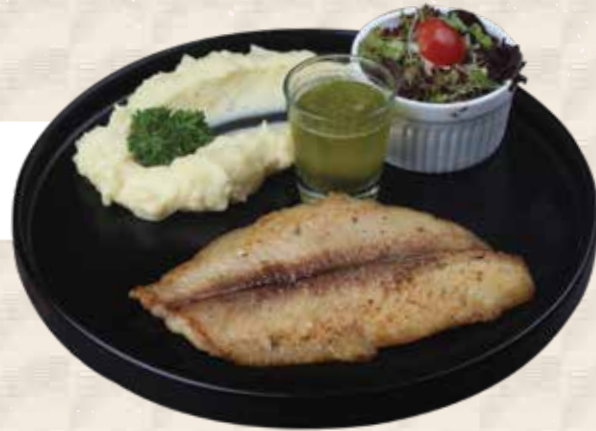
LEMON BUTTER FISH pan fried fish, salad, mased potato lemon butter sauce 60.0 K