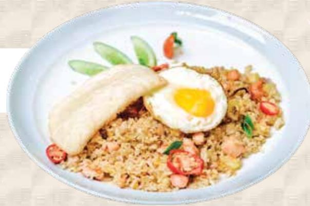
NASI GORENG BEBEK 🌿 fried rice, duck, sambal goang, fried egg, crackers 55.0 K