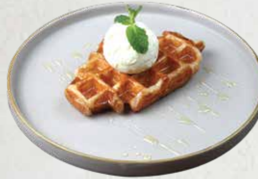
CROFFLE ICE CREAM croissant, maple syrup, honey, ice cream 35.0 K