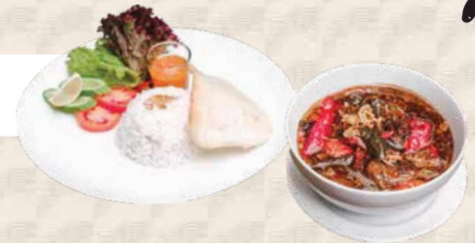
GARANG ASAM sweet, sour and spicy beef soup with rice 85.0 K