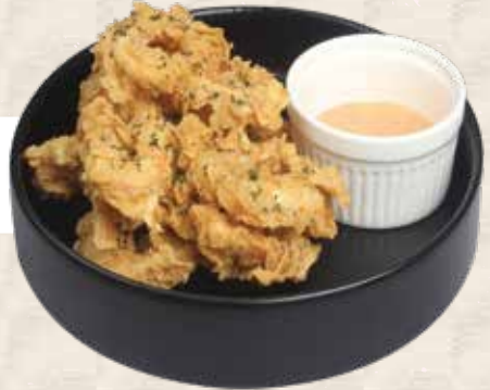
CALAMARY crispy calamary with cipotle sauce 45.0 K