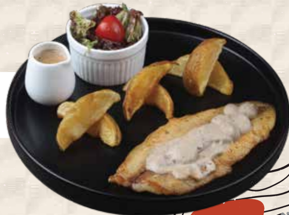
GARLIC BLACKPEPPER FISH pan fried fish, salad potato wedges garlic blackpepper sauce 60.0 K 🍷