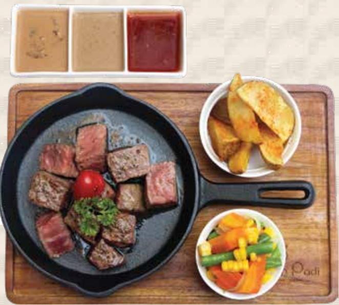
BEEF FONDUE diced AUS tenderloin, 3 kinds of dipping sauce truffle butter sauce 150.0 K 🍷