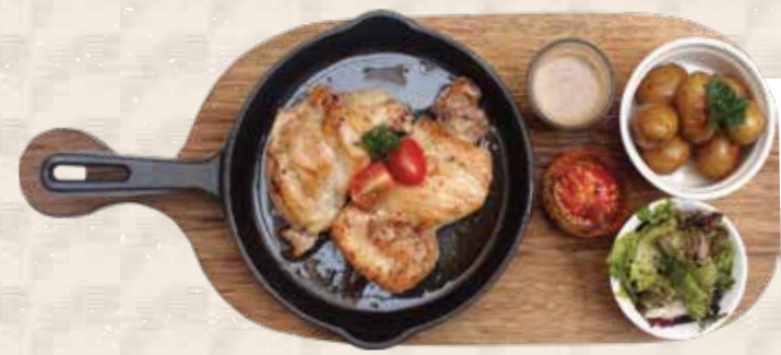
GARLIC CHICKEN STEAK grilled chicken steak, garlic seasoning, salad baby potato 55.0 K