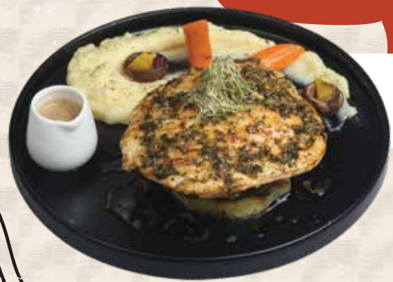
HERB BUTTER CHICKEN grilled herb butter chicken breast, spinach pineapple, grilled tomato, mashed potato blackpepper sauce. 65.0 K 🍷