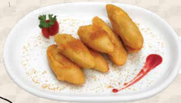
BANANA FRITTERS battered fried bananas with brown sugar 30.0 K