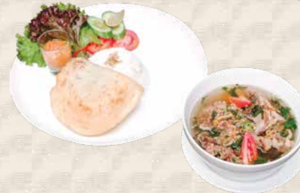
SOP BUNTUT beef oxtail soup in spices with rice 85.0 K 🍷