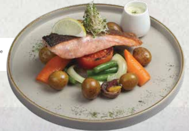
CREAMY SALMON grilled salmon, baby potato, veggie creamy salmon 120.0 K 🍷