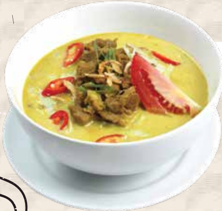
TONGSENG SAPI beef and curry soup, cabbage, with rice and crackers 65.0 K