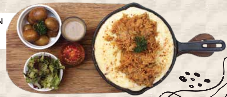
CRISPY MELTED CHICKEN deep fried chicken leg, carbonara sauce mozzarella, baby potato, salad 55.0 K 🍷