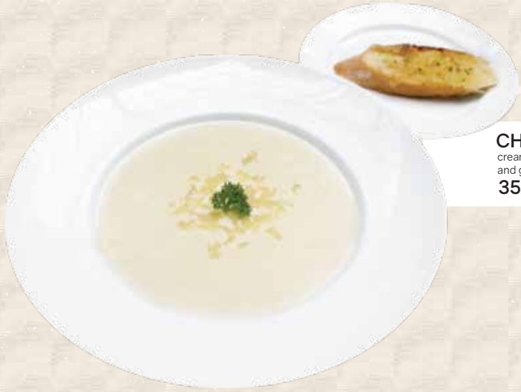
CHICKEN SOUP creamy chicken soup with mozzarella and garlic bread 35.0 K