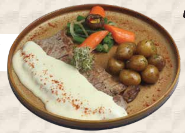
HANGER CHEESE STEAK AUS sirloin, mozzarella, cheese sauce, baby potato, mix veggies 95.0 K 🍷