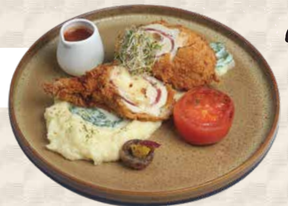
CHICKEN CORDON BLEU crispy deep fried chicken, beef bacon creamy spinach, mashed potato, BBQ sauce 65.0 K 🍷