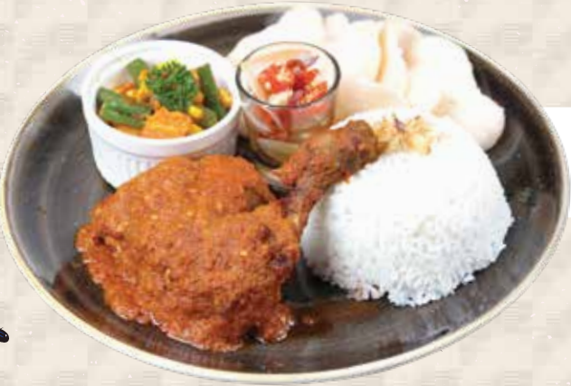
AYAM BUMBU BALI balinese style breast or chicken leg, rice mix veggies, sambal, crackers 55.0 K