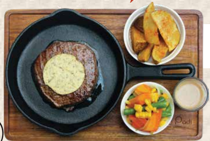
TRUFFLE BUTTER MEDALLION AUS ribeye, mix veggies, potatos wedges truffle butter sauce 160.0 K 🍷