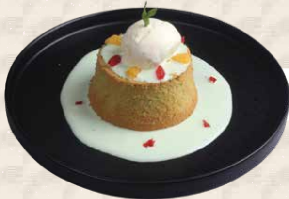
CHIFFON MINI WITH ICE CREAM chiffon cake, ice cream, sweet creamy sauce, mix fruit 35.0 K

ASSORTED CAKE please ask our team for availability cake