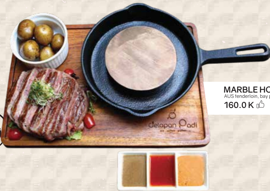
MARBLE HOT STONE AUS tenderloin, bay potato, salad, hot stone 160.0 K 🍷