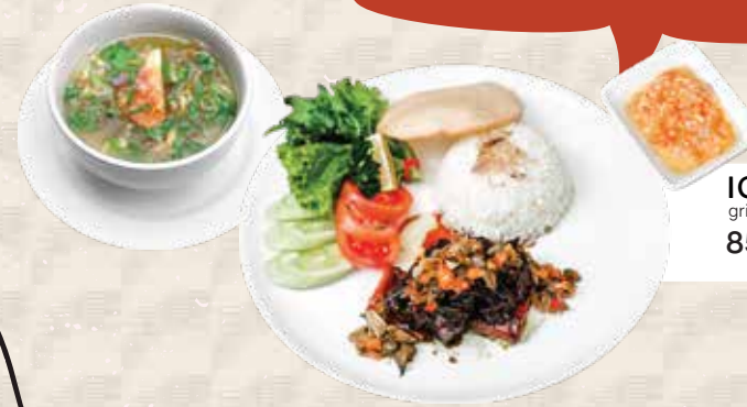
IGA SAMBAL MATAH grilled beef ribs, sambal matah, rice 85.0 K 🍷