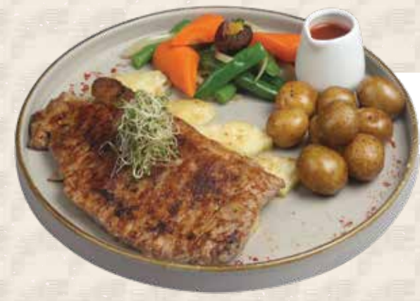
SPICY HAWAIIAN STEAK cajun marinated AUS sirloin, pineapple, baby potato, mix veggies, BBQ sauce 95.0 K 🍷 🌶️