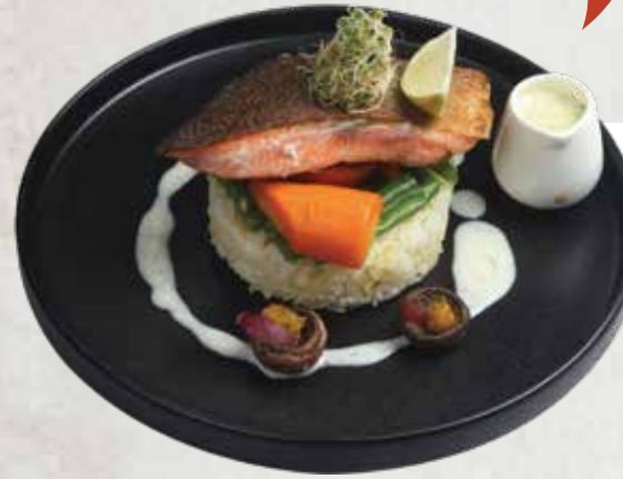
BUTTER RICE SALMON grilled salmon, butter rice veggie creamy sauce 125.0 K