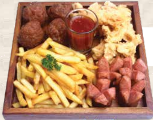
MIX PLATTER Bratwurst, meat ball, chicken karage french fries, bbq sauce 65.0 K