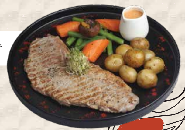
ENTRECOTE STEAK AUS sirloin, mix veggies, baby potato, entrecote sauce 95.0 K 🍷