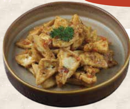
SPICY SALTED TOFU white tofu, egg, spicy salted sauce 30.0 K