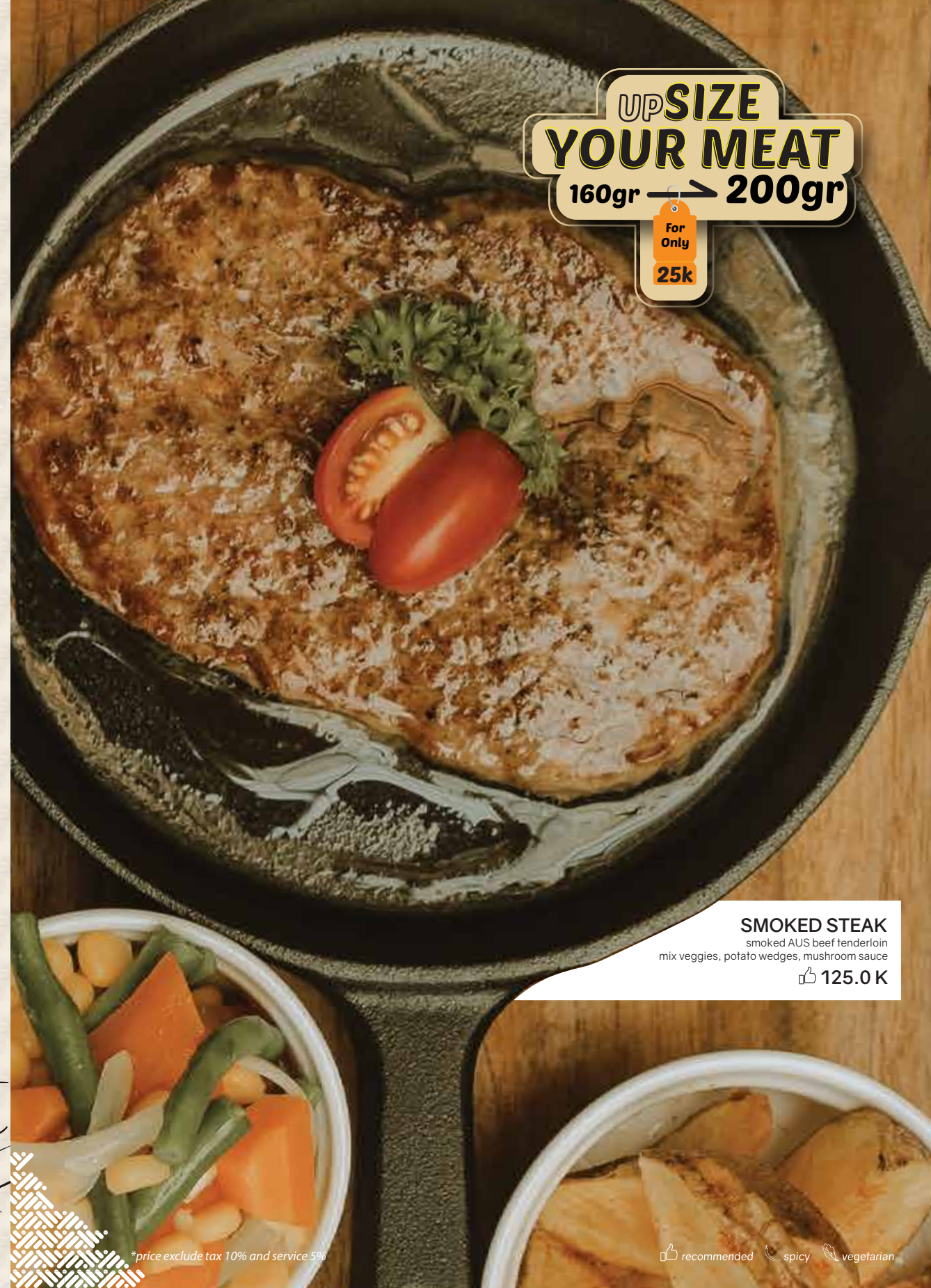
SMOKED STEAK smoked AUS beef tenderloin mix veggies, potato wedges, mushroom sauce 🍷 125.0 K

UPSIZE YOUR MEAT 160gr → 200gr For Only 25k