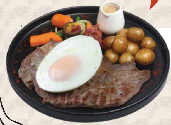
BEEF BACON STEAK & EGG AUS sirloin, beef bacon, sunny side up baby potato, mix veggies 95.0 K 🍷

UPSIZE YOUR MEAT 160gr → 200gr For Only 20k