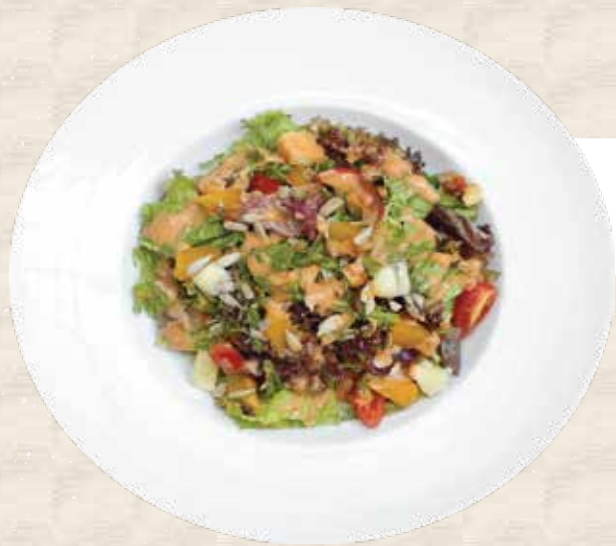
DELAPAN PADI SALAD mix lettuce, seasonal fruits, croutons Delapan Padi peanut dressing 30.0 K 🌿