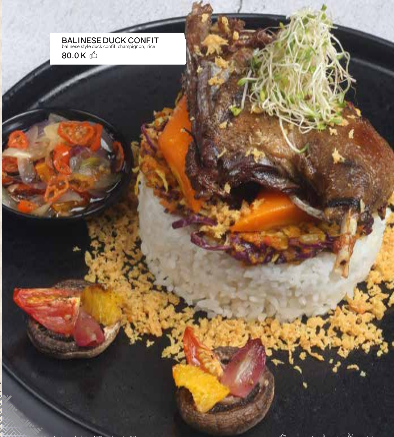
BALINESE DUCK CONFIT balinese style duck confit, champignon, rice 80.0 K