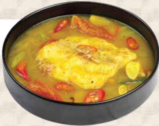
PINDANG DORI SERANI pouched dorry in pindang soup with rice and crackers 55.0 K