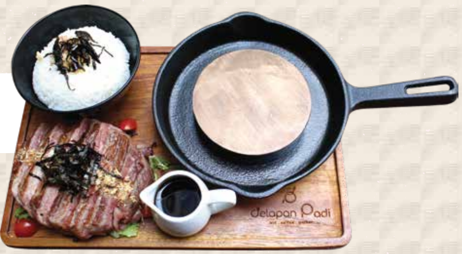
JAPANESE TERIYAKI HOT STONE AUS tenderloin, rice, teriyaki sauce, seaweed, katsuobushi 160.0 K 🍷