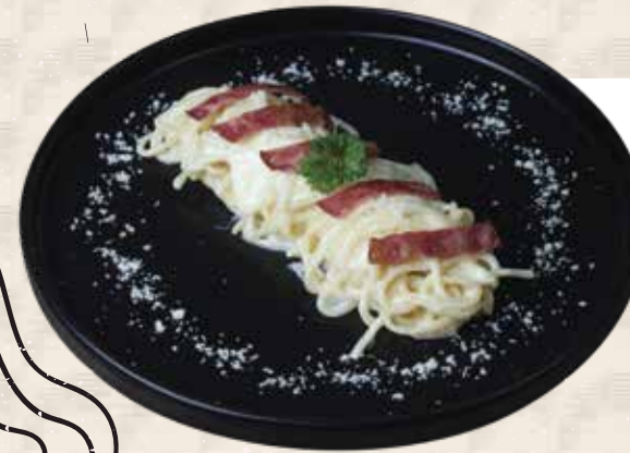
SPAGHETTI CARBONARA creamy carbonara, spaghetti, beef bacon 45.0 K