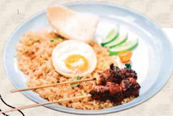
NASI GORENG KAMPUNG fried rice, sweet chicken skewer, fried egg shrimp crackers 40.0 K