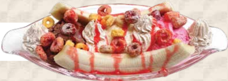
BANANA SPLIT ice cream banana fruit loops whipped cream 35.0 K