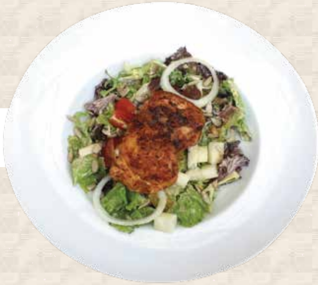
CHICKEN SALAD mix lettuce, grilled chicken leg mix fruit, thousand island dressing 40.0 K 👍