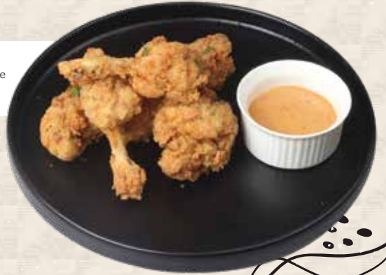
FRIED CHICKEN DRUM crispy and Juicy chicken wings, with cipotle sauce 40.0 K