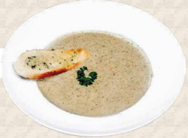
MUSHROOM SOUP creamy champignon soup with mozzarella and garlic bread 35.0 K 👍