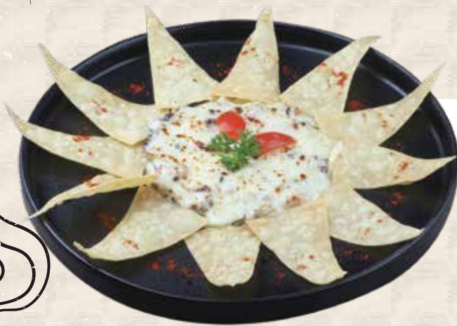
CREAMY CHICKEN NACHOS tortilla chips, chicken dice, champignon mushroom creamy sauce 35.0 K