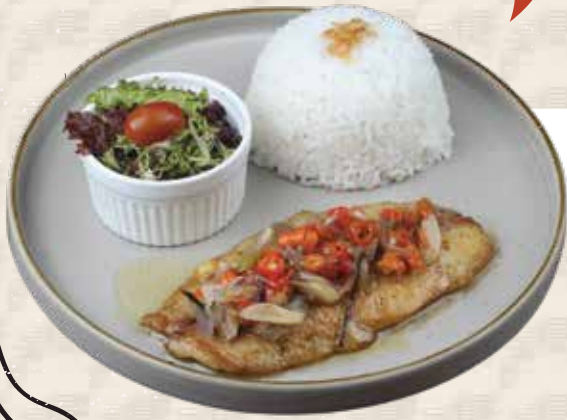
SAMBAL MATAH FISH pan fried fish, sambal matah, rice, salad 60.0 K 🍷 🌿