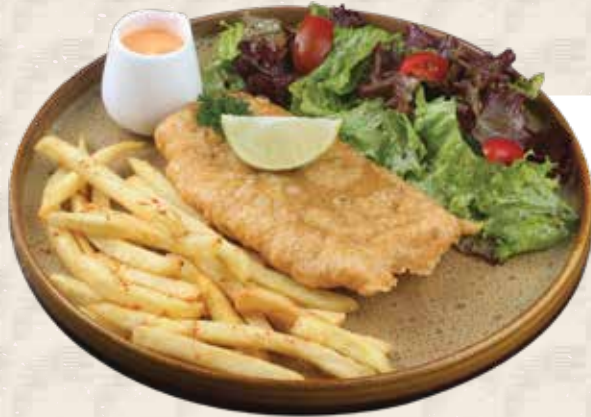
FISH AND CHIPS deep fried dory, french fries, salad, spicy mayo sauce 60.0 K