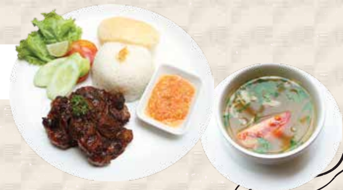
BUNTUT GORENG fried beef oxtail, sweet sauce, rice 85.0 K